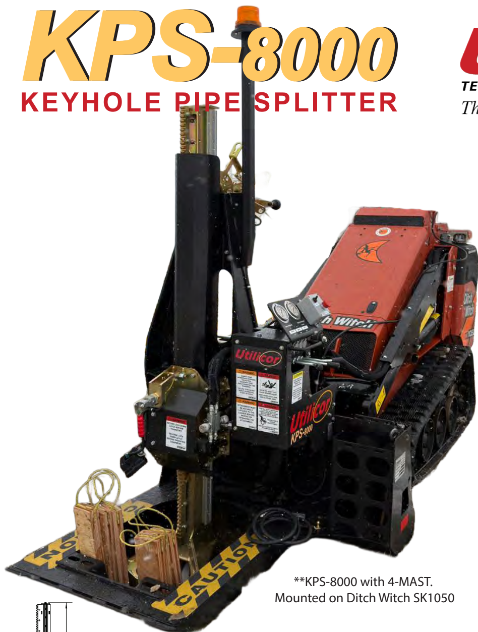
**KPS-8000 with 4-MAST. Mounted on Ditch Witch SK1050

The cutting edge in keyhole technologies